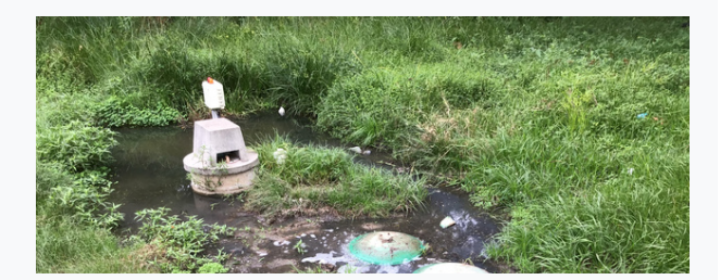
Proper maintenance can help prevent septic system failures.

Don't drive or park on the drainfield and only plant grass over it or nearby