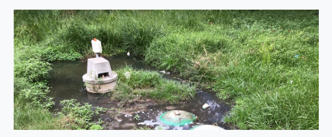
Proper maintenance can help prevent septic system failures.

Don't drive or park on the drainfield and only plant grass over it or nearby